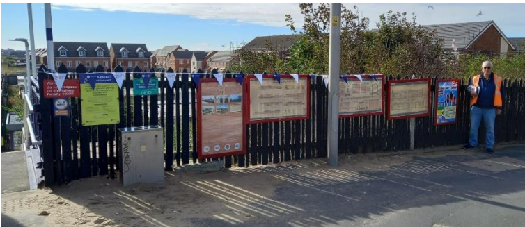
Figure 1 Creating an eye catching entrance to Squires Gate Station