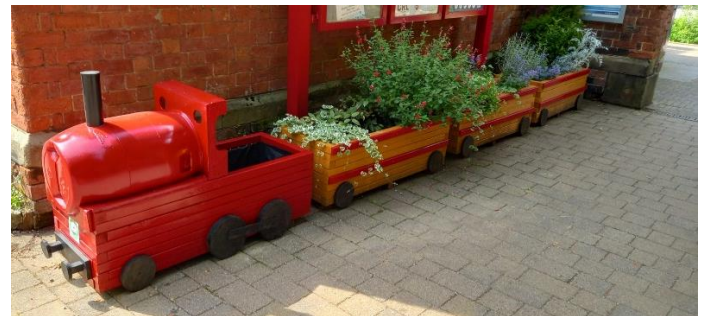
Figure 2 'All Aboard'