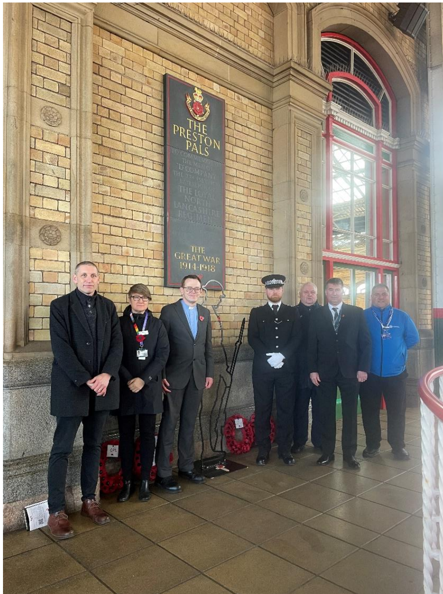
CRL attended the Remembrance service held at Preston Station on the 10 th November 2023.

CRL joined the Remembrance service held at Preston station on the 10 th November along with the Railway Chaplain, BtP, Avanti WC, TP and Northern.