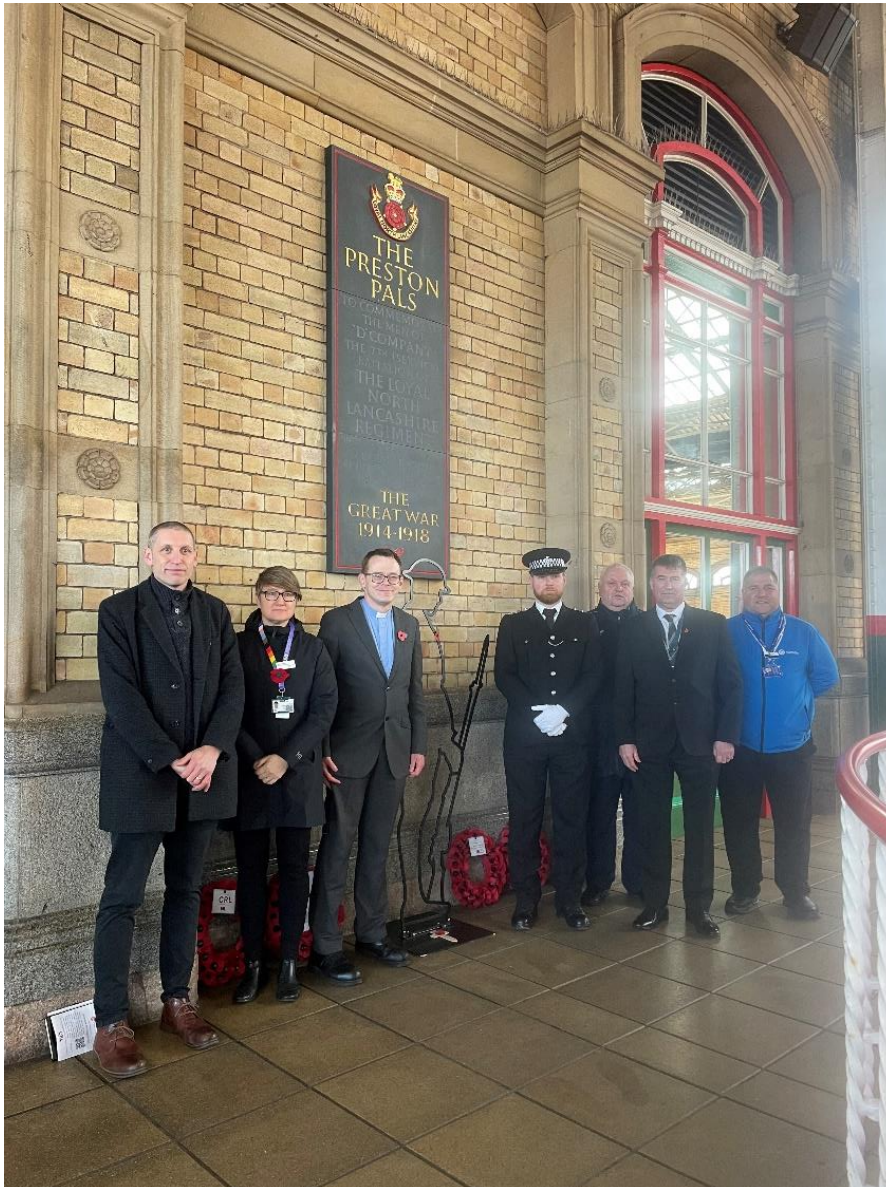
CRL attended the Remembrance service held at Preston Station on the 10 th November 2023.

CRL joined the Remembrance service held at Preston station on the 10 th November along with the Railway Chaplain, BtP, Avanti WC, TP and Northern.