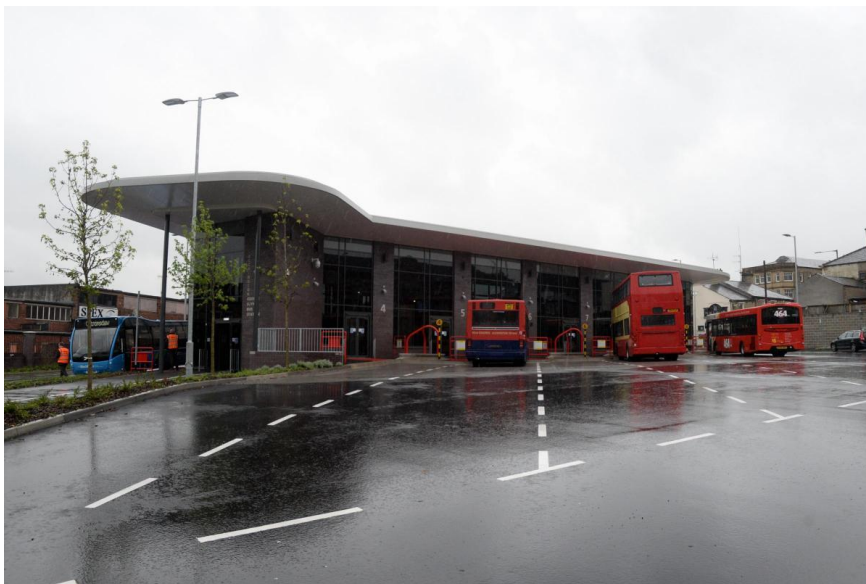
Accrington Bus Station

https://communityrail Lancashire.co.uk/news/integrated-sustainable-travel-grant-awarded/