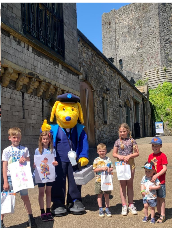
Whistle the Dog at Clitheroe Castle