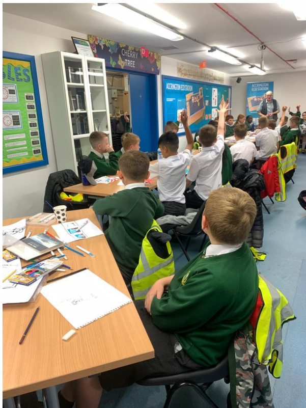
Hippings School in the bunker taking Part in the ‘This is Us’ project