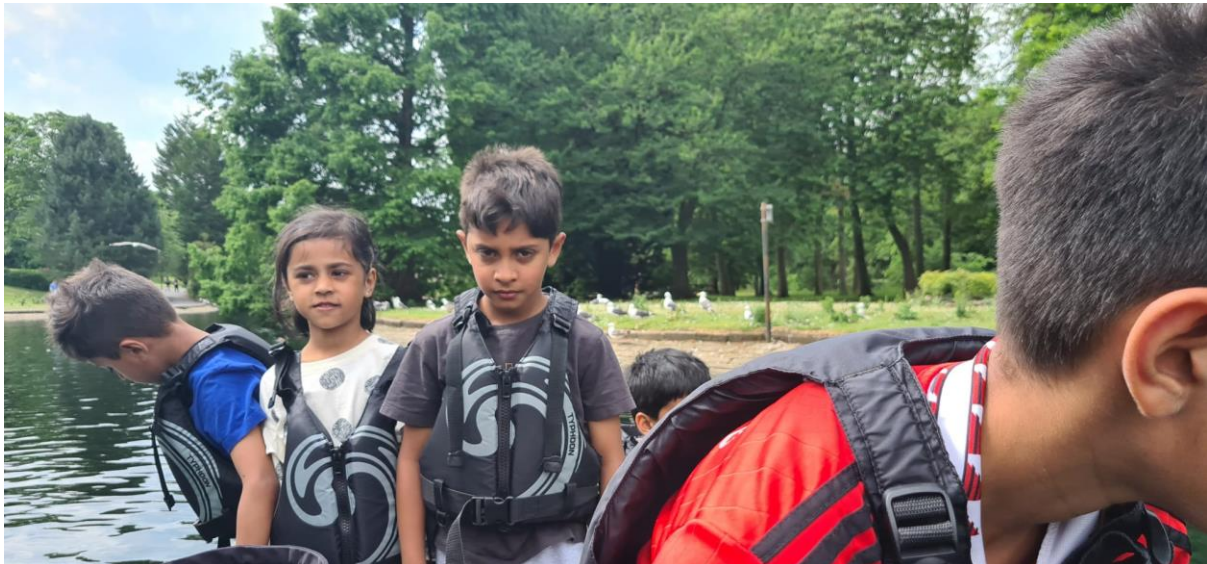
Chattering Chimmers at Burnley

Let's Connect Communities an initiative between the ELCRP, CRL and LCC is supporting 9 projects across East Lancashire. Over £19,000 in grants has been awarded to community groups including the Saliheen Scouts, the Brave Church, the Chattering Chimmers CIC, Community Solutions NW, Arts2Heal and Huckleberry Films. A full report on the progress of this project is attached.