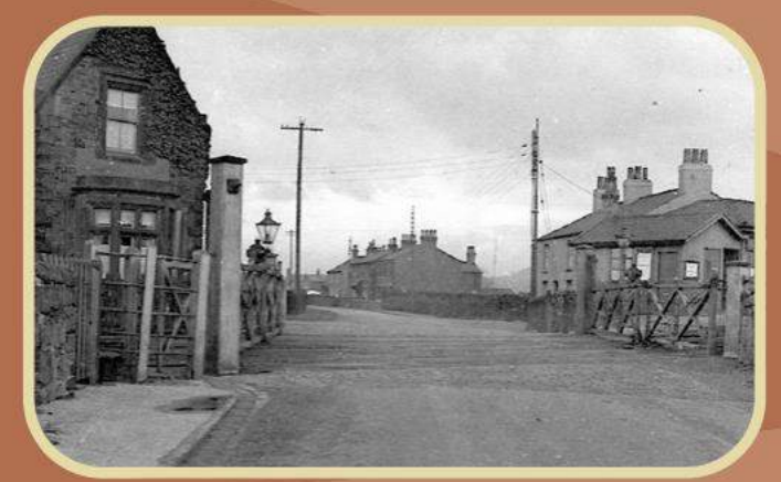
Hoscar crossing looking East