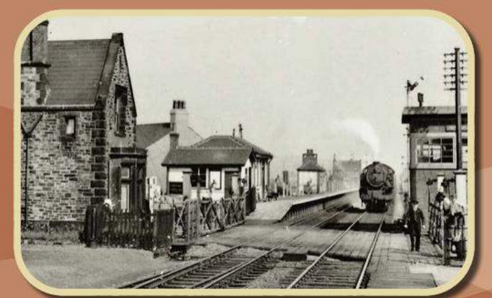
Hoscar LMS ARP Box 42287 with the 3pm Manchester-Southport, June 1st 1954