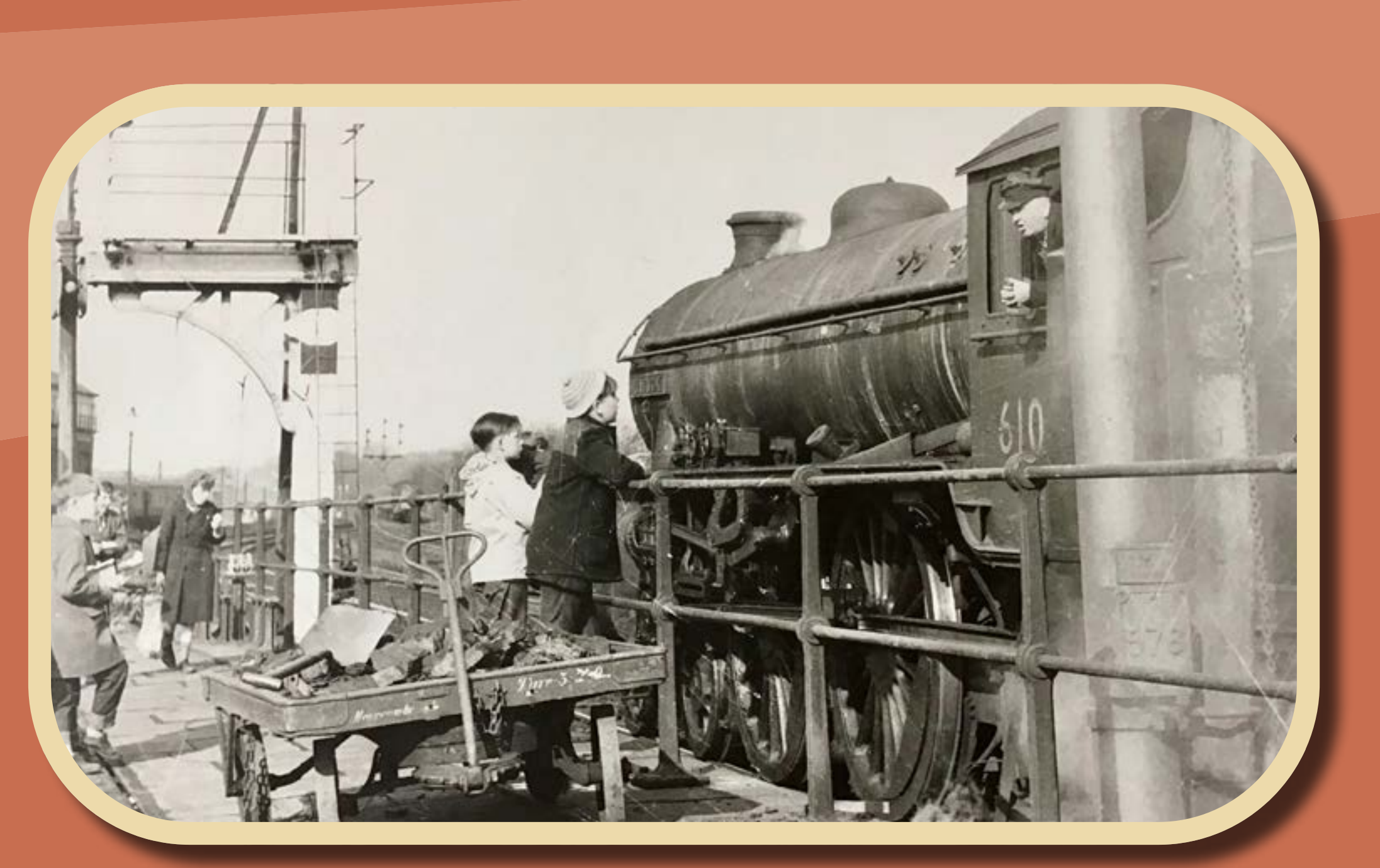
Trainspotters talk to the driver of an Eastern Region Cass B1 as it awaits departure from Lancaster Castle Station in the 1960s.