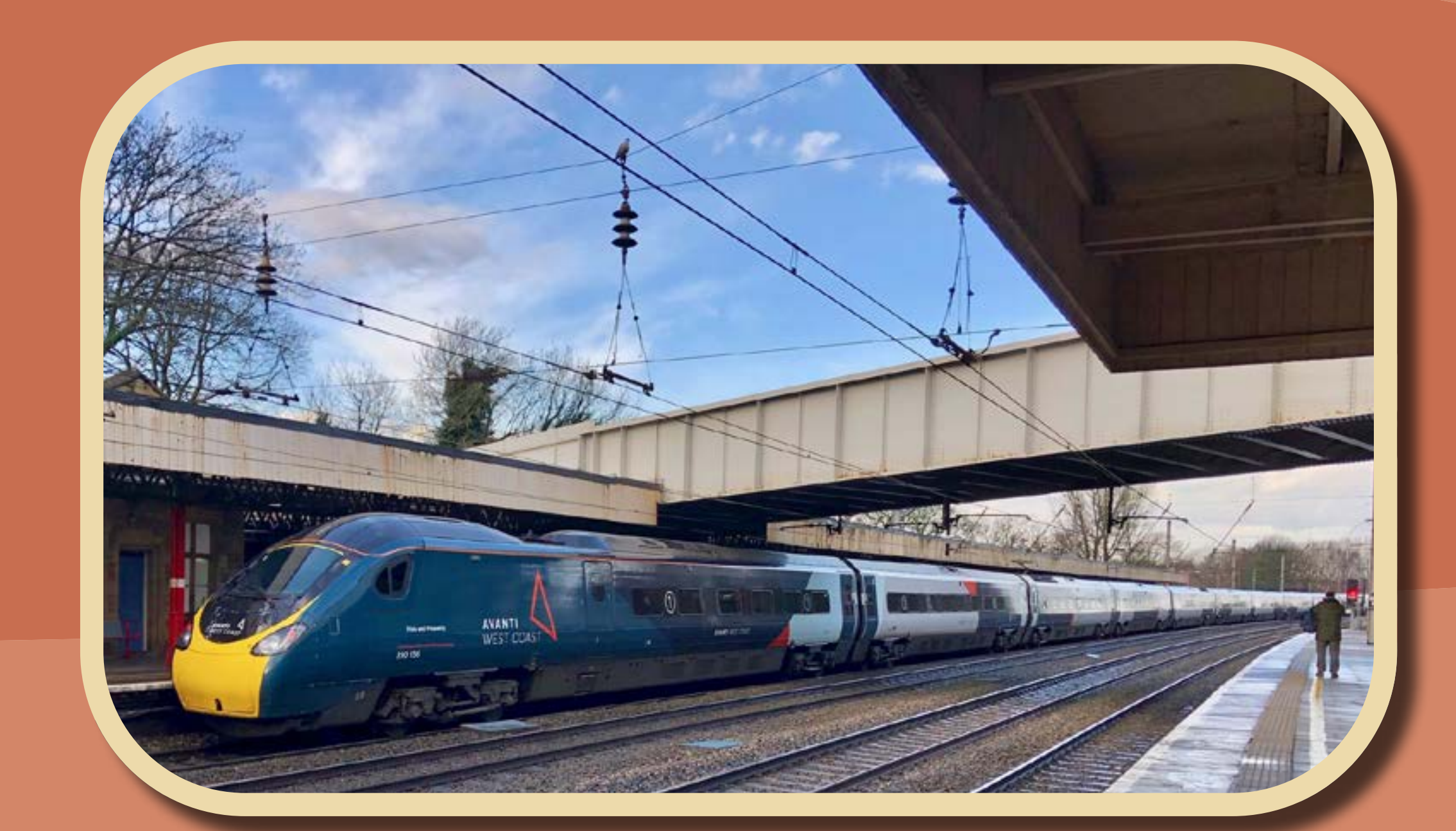
One of the first 'Pendolino' units to be covered in Avanti West Coast livery, 390156 stands at the platform at Lancaster Castle Station awaiting departure with a Glasgow service, in December 2019.