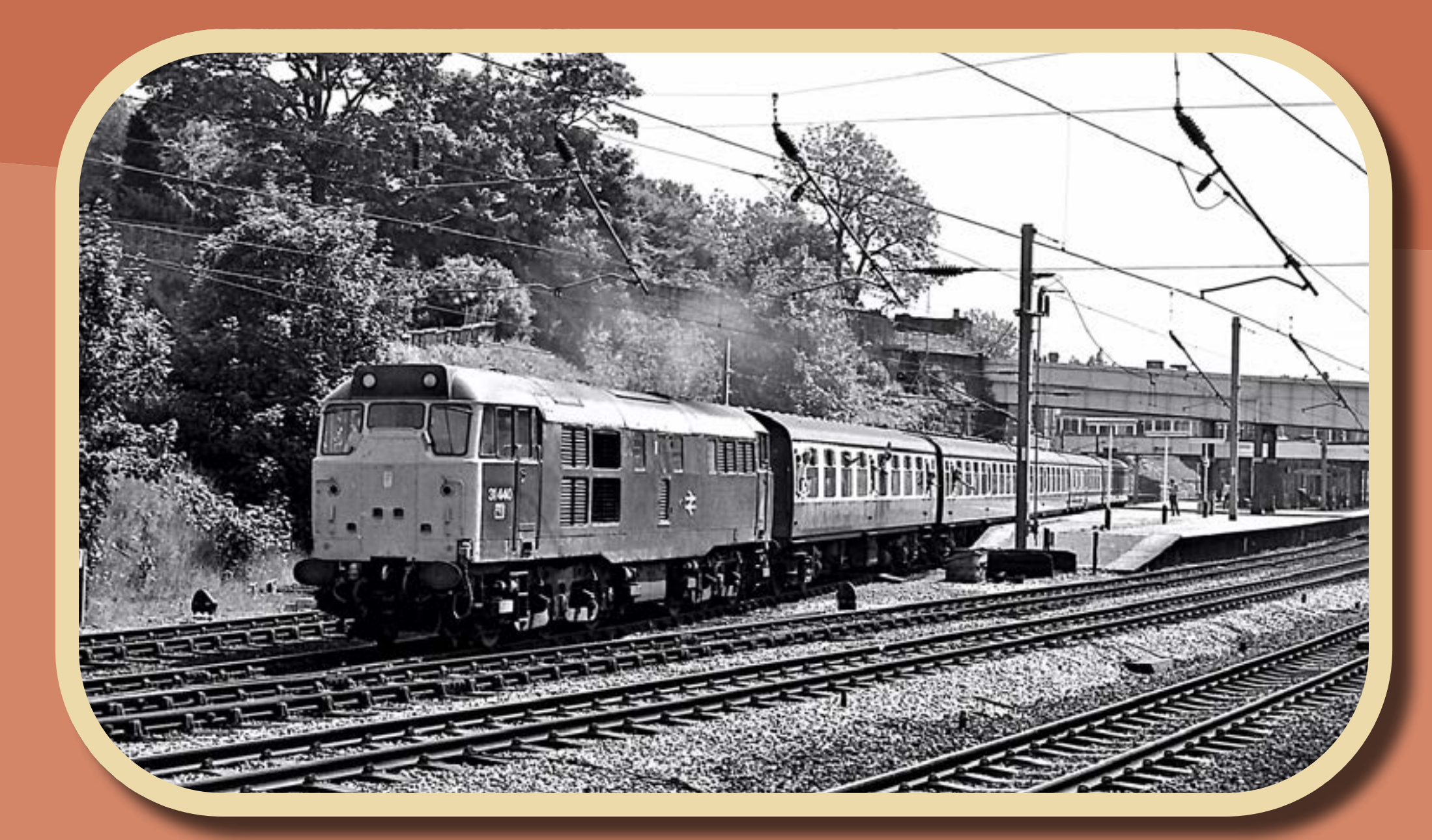
A Class 31 Diesel departs Lancaster Castle with a Leeds Service in the early 1980s.