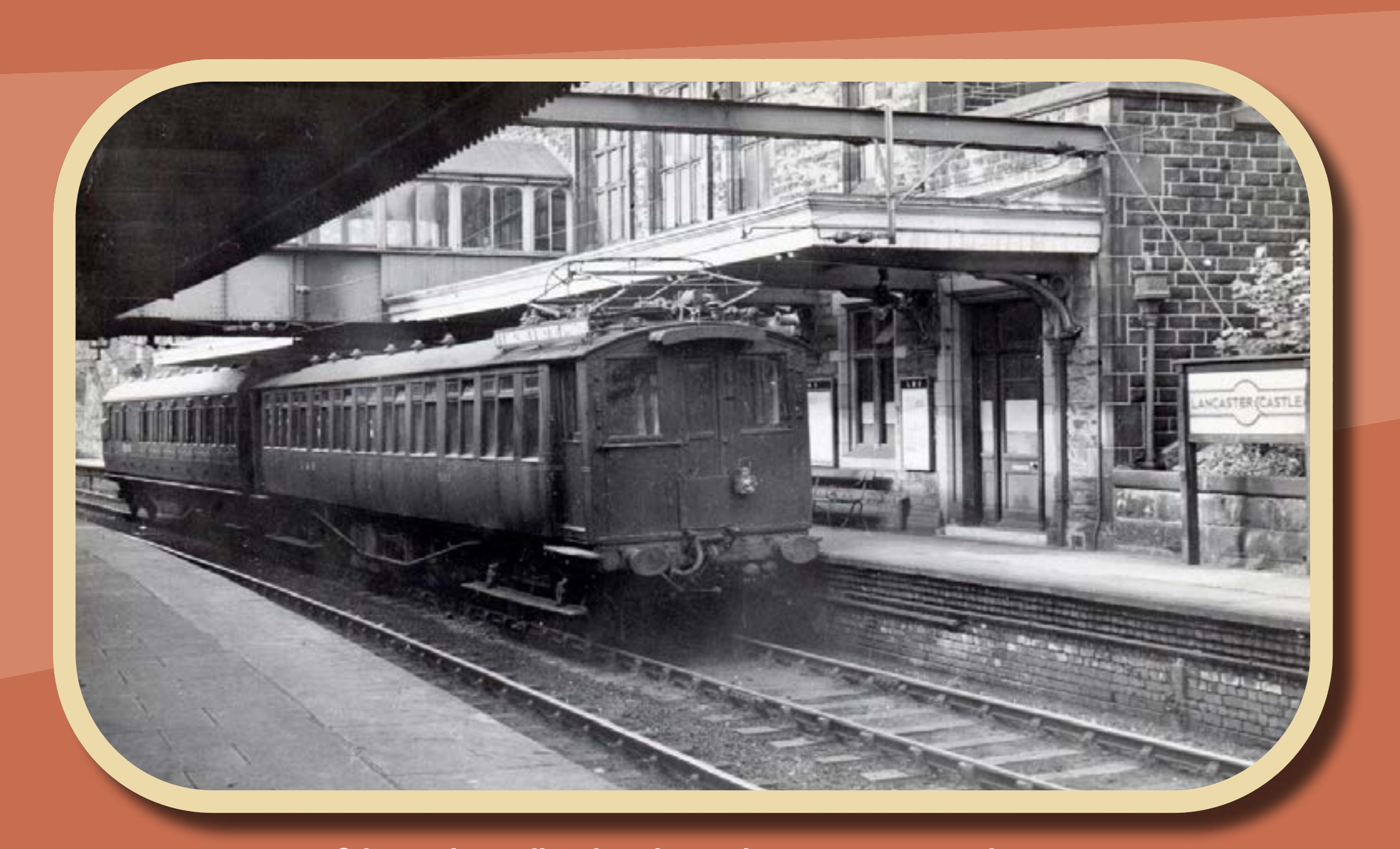
One of the early Midland Railway electric units stands awaiting departure from Lancaster Castle Station