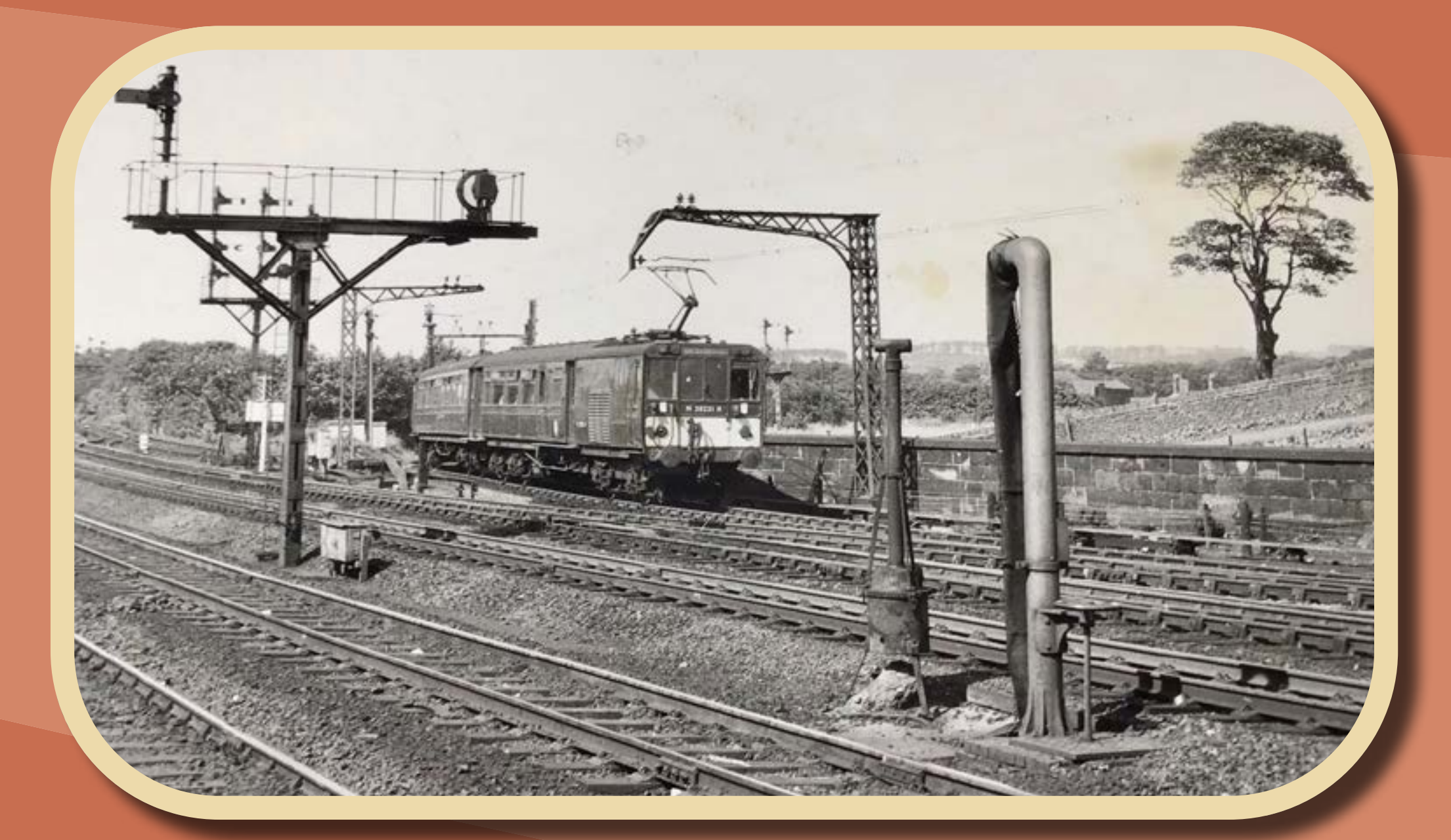
One of the later class of British Railways electric units glides up the gradient from Lancaster Green Ayre and approaches Lancaster Castle Station in the early 1960s.