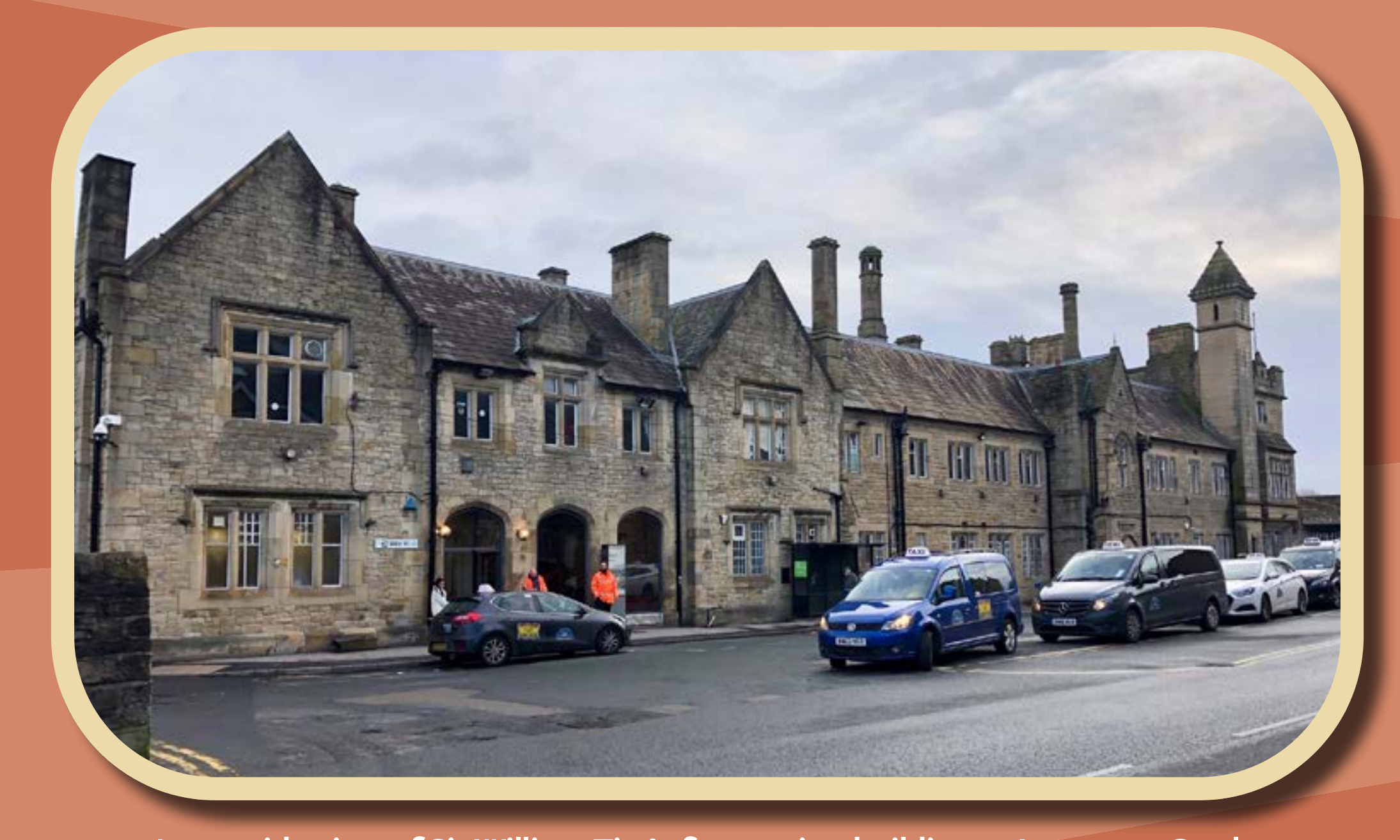
An outside view of Sir William Tite's fine station building at Lancaster Castle. The turret with its internal stone spiral staircase housed the office of the line engineer and locomotive superintendent.

Lancaster's main railway station was opened on the present site on 21st September 1846, originally built as the southern terminus of the Lancaster and Carlisle Railway. The company's engineer, Joseph Locke, is commemorated by a plaque on platform 3. The architect, Sir William Tite, located the main station buildings on the western side of the running lines. A dressed sandstone Tudor-revival style was used to blend