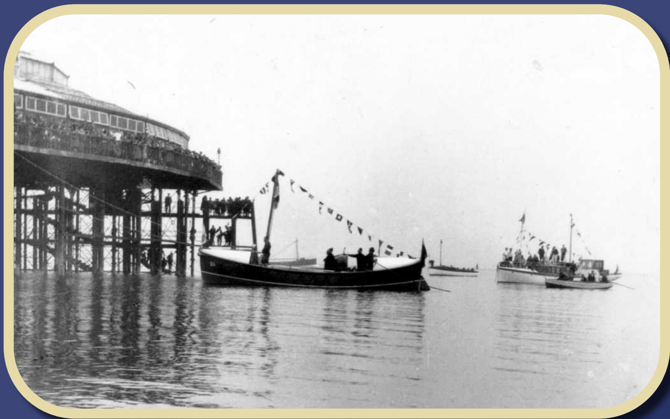
The first Lytham St Annes Lifeboat, the JHW, at Lytham pier for her naming ceremony in 1931 after the two branches, Lytham and St Annes, had amalgamated.