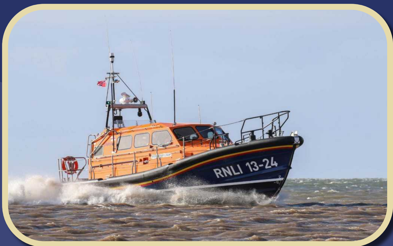
The current Lytham St Annes Shannon class All-weather Lifeboat Barbara Anne. (On Station since 2018).