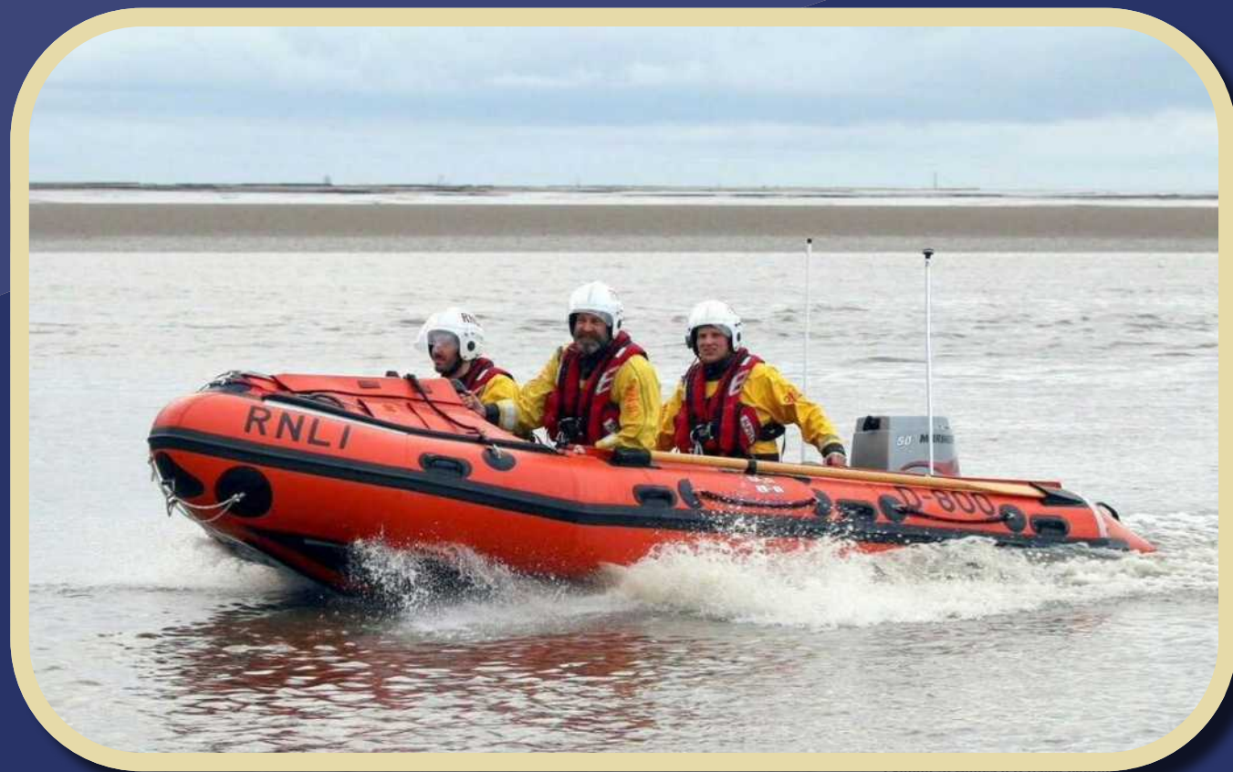
The current Lytham St Annes D class Inshore Lifeboat (ILB) D-800 MOAM at sea. (On Station since 2016).