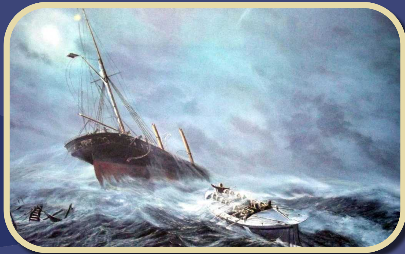
Painting of the Wreck of the Mexico with Lytham Lifeboat Charles Biggs approaching to make the rescue of the crew by (the late) Edward D Walker.