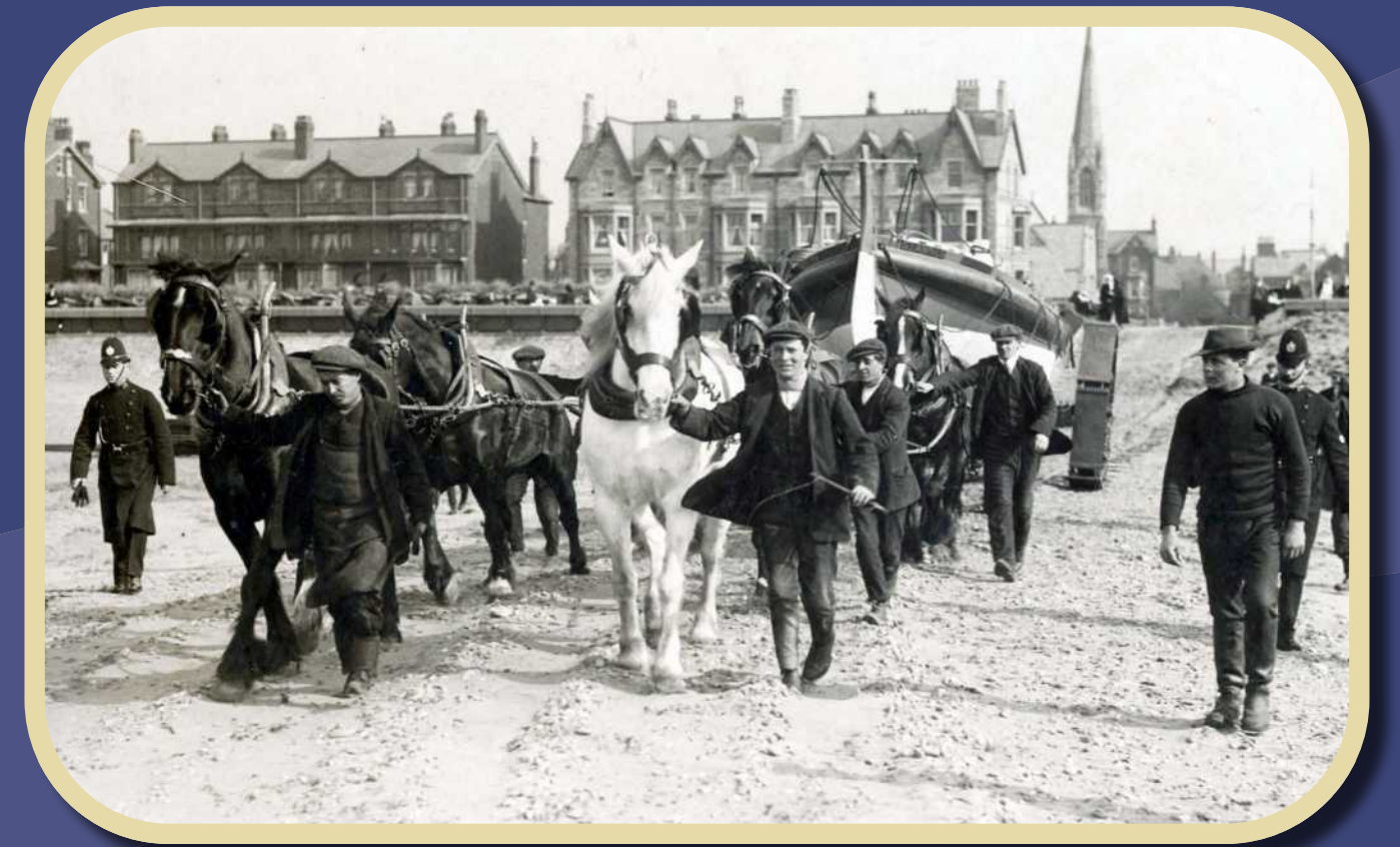
The last St Annes Station Lifeboat before the Station closed in 1925, the James Scarlett being drawn by horses from her Eastbank Road Boathouse onto the beach to launch into the sea. This is virtually the same position as where the present day Lytham St Annes Station All-weather Lifeboat Boathouse is situated.