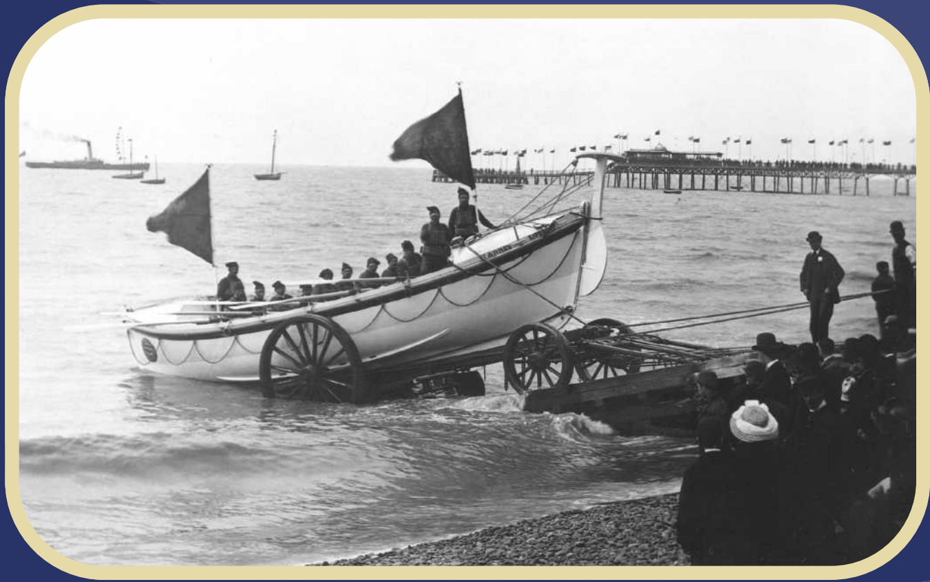
The ill-fated St Annes Lifeboat Laura Janet poses ready to launch on the opening day of St Annes pier 15th January 1885. Sadly many of these men would lose their lives the following year.