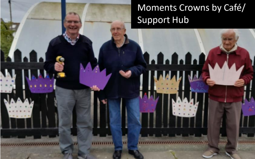
Moments Crowns by Café/ Support Hub