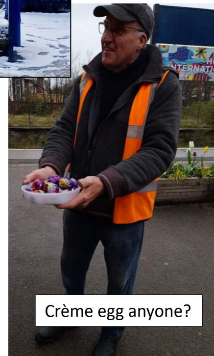
Crème egg anyone?