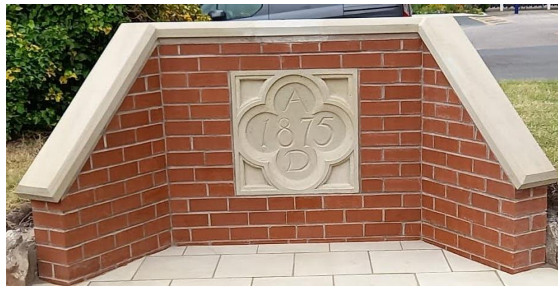
The replica of the St. Anne's on the Sea Foundation Stone was completed and officially unveiled by Town & Borough Mayors in November. The original is set into the wall of the public house opposite the station.