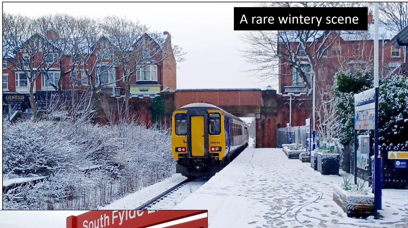
A rare wintry scene