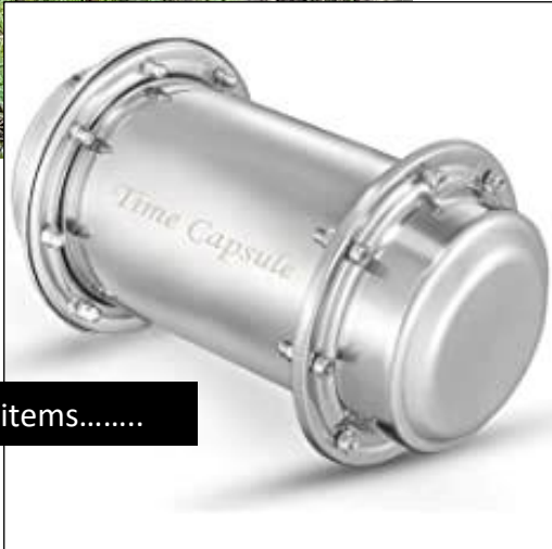
Time Capsule – request for items.....