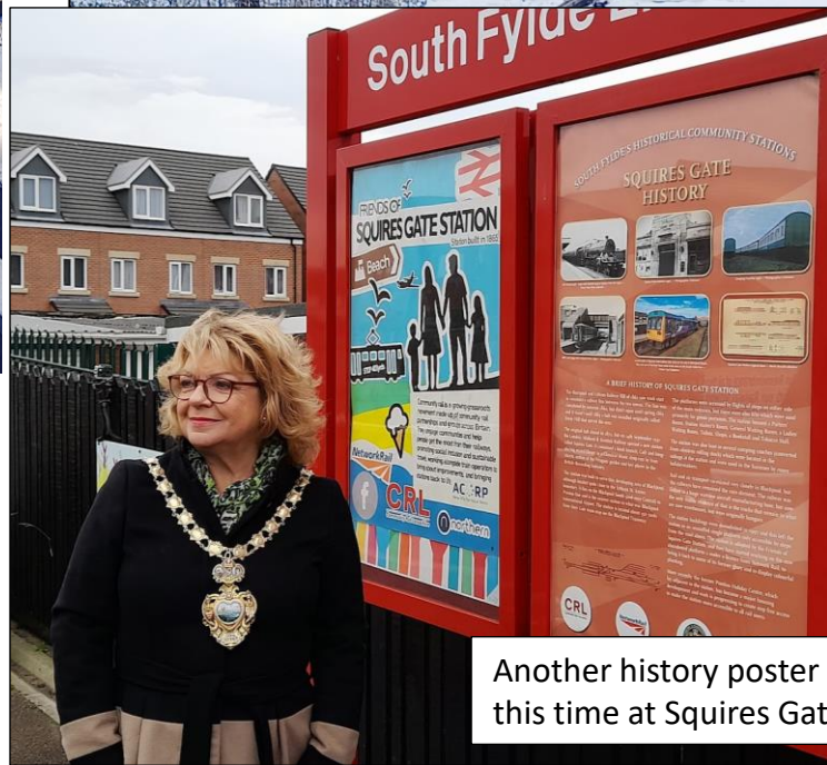
Another history poster installation - this time at Squires Gate