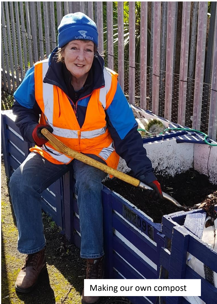
Making our own compost