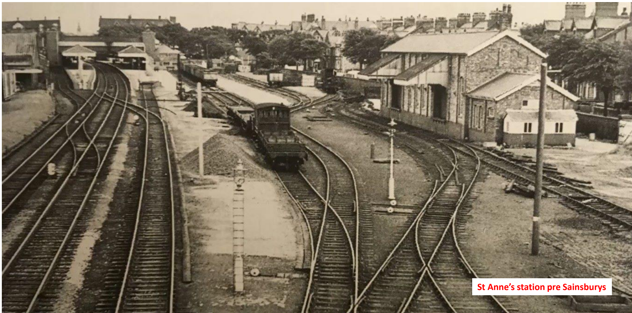
St Anne's station pre Sainsburys