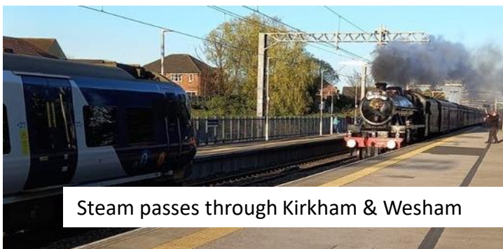
Steam passes through Kirkham & Wesham