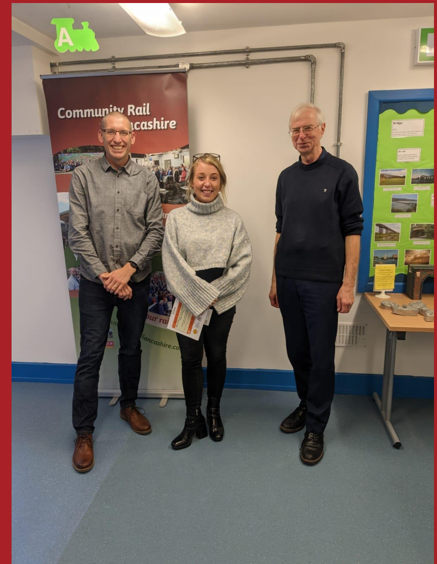
We welcomed Sara Britcliffe, MP, to the Bunker on the 4 th November

The 2023 draft CRP Activity Plan has been circulated for comment.