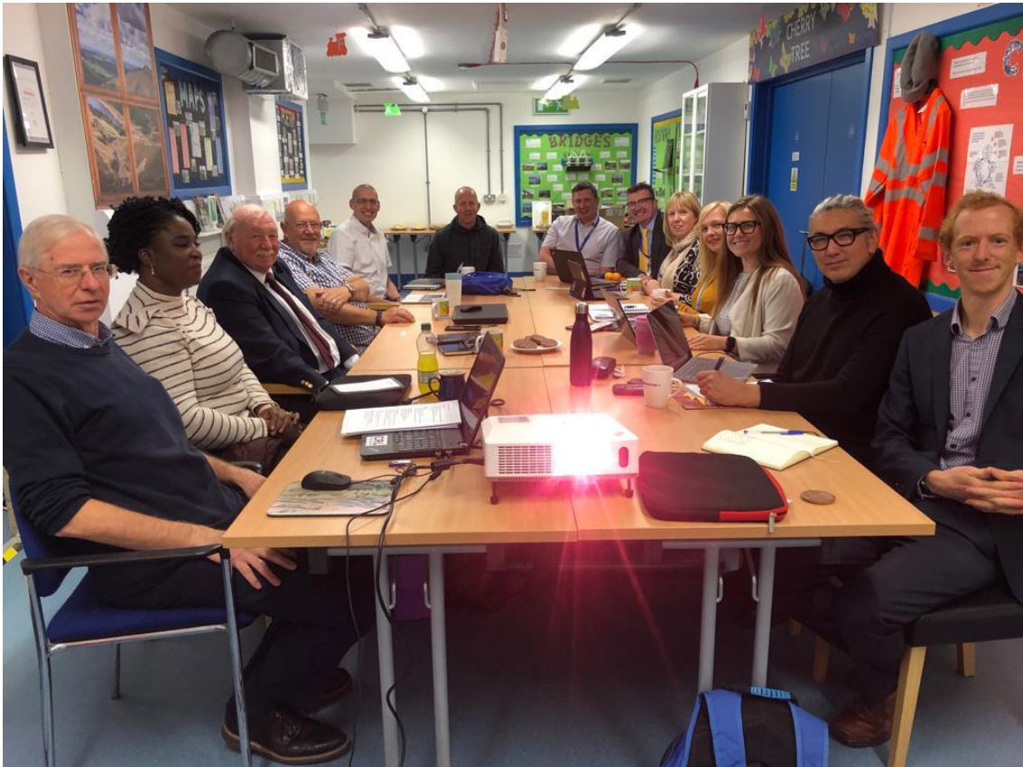
Accreditation meeting taking place at Accrington Eco Station