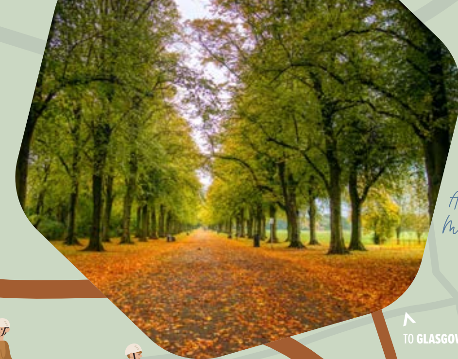
Avenham & Miller Parks