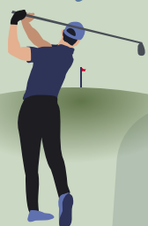
Royal Lytham and St Anne's Golf Course