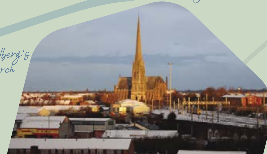
St Walberg's Church