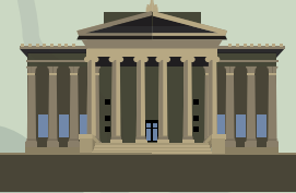
Harris Museum & Art Gallery

On leaving Preston station look to your right to see ST WALBURGE'S CHURCH probably the city's premier landmark. It was designed by Joseph Hansom of Hansom Cab fame. At 94 metres (308 feet) it boasts the third largest spire in England.