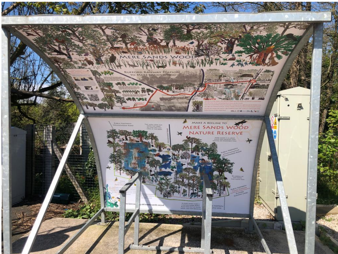
Rufford station to Mere Sands Wood artwork displayed in the Cycle shelter

As mentioned above the project was launched on the 22 nd April at Rufford Station to an invited audience as well as the excited young artists for the school! A news item about this can be viewed by clicking this link: https://communityrailancashire.co.uk/news/rufford-to-mere-sands-wood-walks-leaflet-launched/ . This also includes a link to the very attractive leaflet.