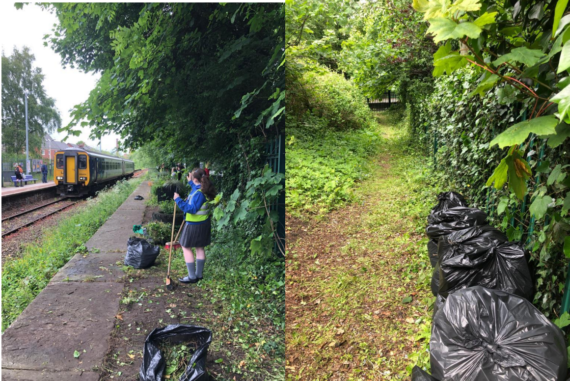
Community Rail Week: Burscough Junction tidy up during (left) and after (right).

A full resume of all that took place during the week can be viewed by clicking on this link: https://communityraillancashire.co.uk/news/successful-community-rail-week-in-lancashire/ this includes a film show the weeks highlights. If you want a sneak preview click this link: https://youtu.be/OgzaWiax7BQ