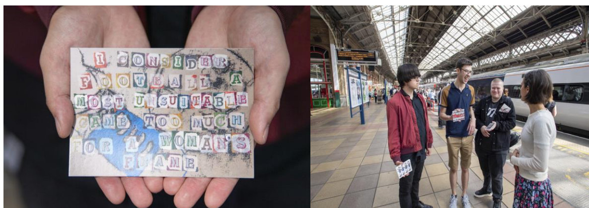
Sample postcard and at Preston station handing them out