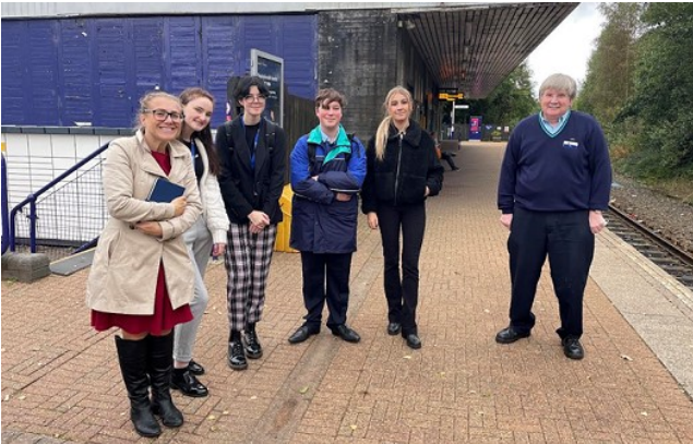
The apprentices at Burnley Central

In addition to delivering projects which bring our diverse communities to the railway, the team have engaged with over 1500 primary and secondary school pupils both in school settings and on train trips. Ten schools on the Bradford to Leeds via New Pudsey line which has seen a spike in trespassing have been engaged with. Two of these schools have also adopted New Pudsey and Bramley Stations. In addition, Burscough Junction has been adopted by a school in the west. Projects have also taken place with Rufford C of E School and Padiham Green C of E Primary. Blackburn and Nelson & Colne colleges have also engaged with CRL to enthuse young people into careers in the rail industry. CRL has continued to support Northern's Business apprentices, who are working on improving Burnley Central Station's image this year as well as attending the trip to Accrington Mosque on World Hijab Day (see also page 25).