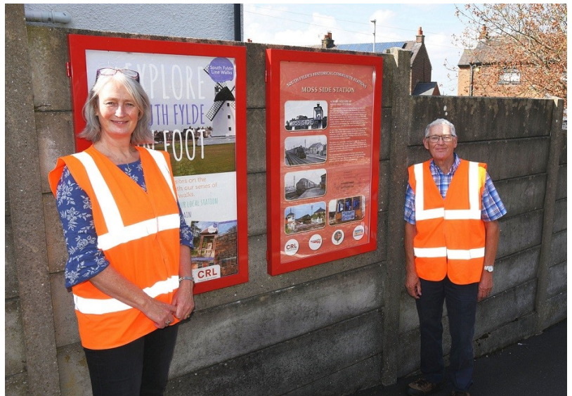
Unveiling the new Moss Side history poster

History Posters depicting the development of stations over time were installed at St Anne's, Moss Side, Lytham and Salwick and one is shortly to be installed at Squires Gate.