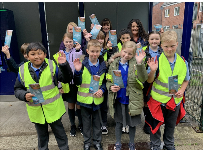
St John’s RC Primary School launching the leaflet at Burscough Junction Station on 18th October 2021