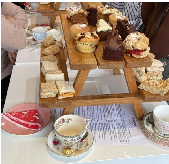
An East Meets West afternoon tea

Before the trip a survey was sent out to everyone about their experiences of train travel and what they hoped to gain from the project. Almost 30% of them highlighted lack of confidence as the main reason they would not travel by train. This shows how important projects like this can be in helping people to access public transport. In March, the Accrington group headed to Bradford to visit the Media Museum and eat at the International Restaurant. The project will continue into the summer.