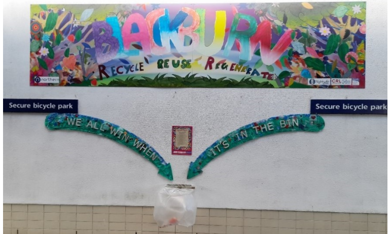
The Fantastic Plastic signs in place on Blackburn station

After being awarded a grant from the Community Rail Development Fund (CRDF) a project called 'Fantastic Recycled Plastic' has seen Community Rail Lancashire Officers work with Newfield School, a secondary school for pupils with varying physical and educational needs in Blackburn. Working in partnership with a local artist, it was decided that the children would develop an art project that promoted sustainability and rail travel. After initial discussions between the school and artist the Fantastic Plastic project was born. Utilising the plastic from milk bottles, the plastic was melted down and made into tiles that were used to form a piece of artwork. The artwork has now been completed and will be showcased at Blackburn Railway Station with a replica displayed at the school.