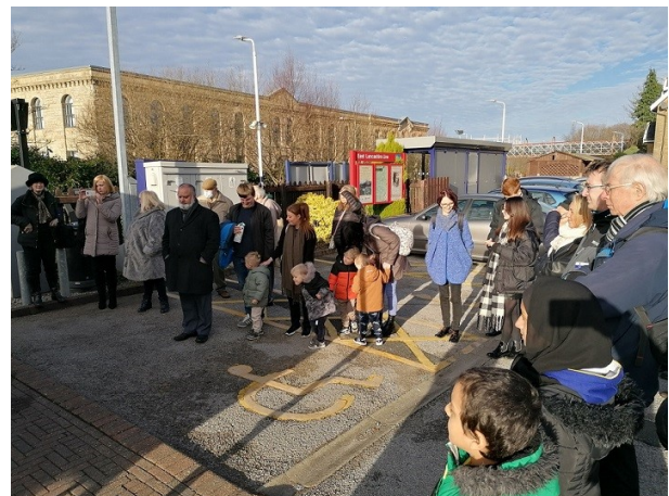
The unveiling of the cycle shelter artwork on Brierfield station