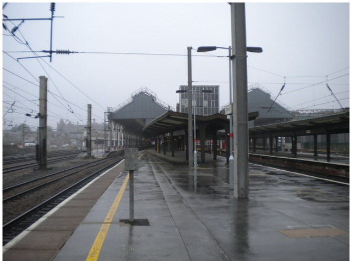
The very dismal south end of Preston station