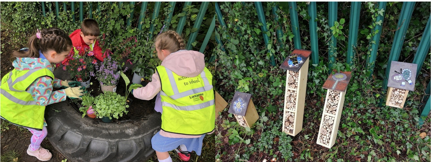
Pupils planting up tractor tyres on the disused platform

A best practice paper about the project can be viewed here: https://communityraillancashire.co.uk/wp-content/uploads/2021/10/Positive-Train-of-Thought-Report.pdf