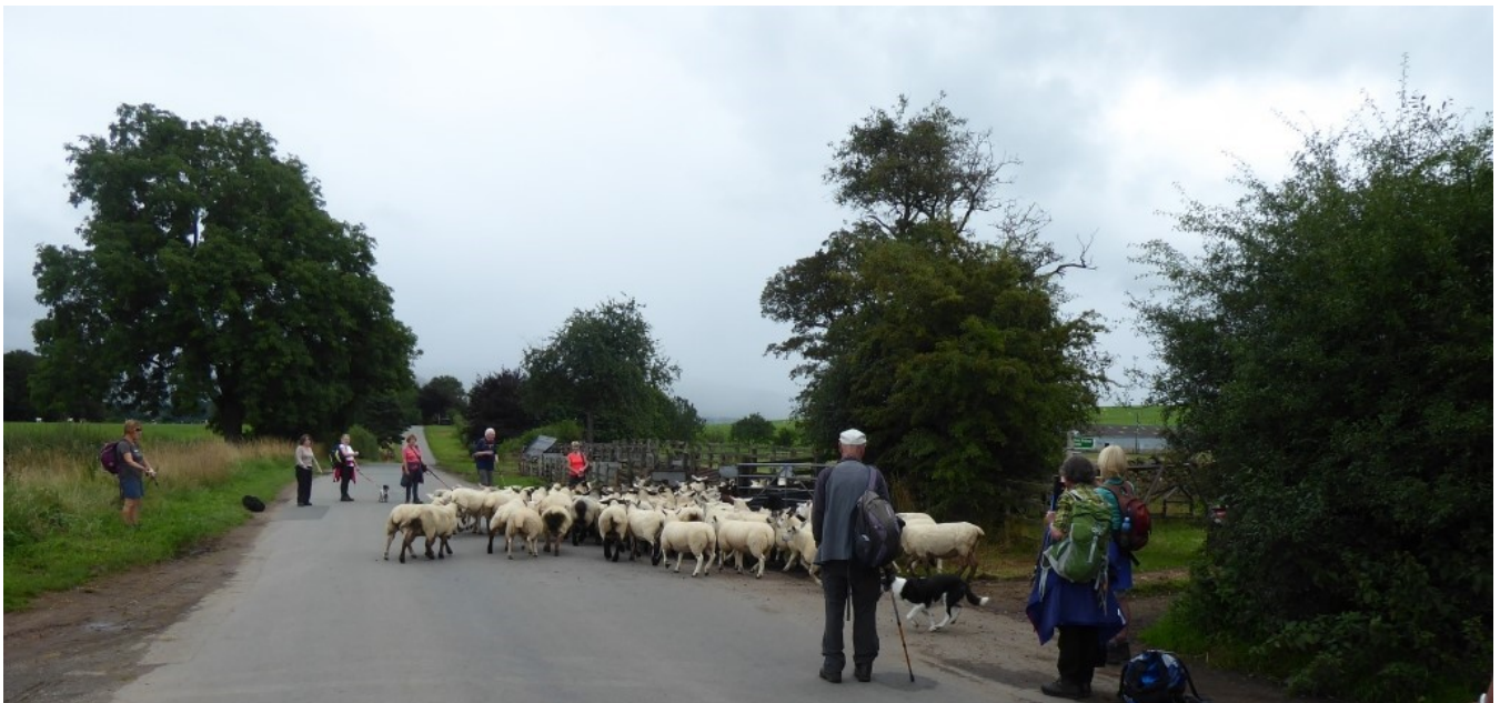
Lending a helping Hand

Unfortunately, the season didn't run smoothly as six trains were cancelled due to COVID infections among rail staff at Blackpool Traincrew Depot and a shortage of staff resulting from the Sunday voluntary working contract under which Northern drivers operate to the west of the Pennines. At least a few days' notice of cancellations was given which meant walks' leaders and potential passengers weren't too inconvenienced.