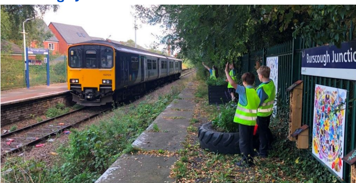
St. John’s RC Primary School pupils acknowledge the approach of a train