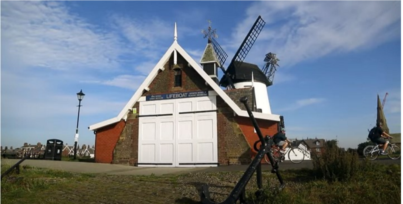
The old lifeboat station and windmill on Lytham Green

Over the last twelve months a series of films has been made for Community Rail Lancashire by a local film company Huckleberry Films which are designed to encourage people to Explore Lancashire by Rail. Four films have been made so far one for each of the Clitheroe Line, the East Lancashire Line, the South Fylde Line and the West of Lancashire Line (Preston to Ormskirk) with a fifth film in the pipeline.