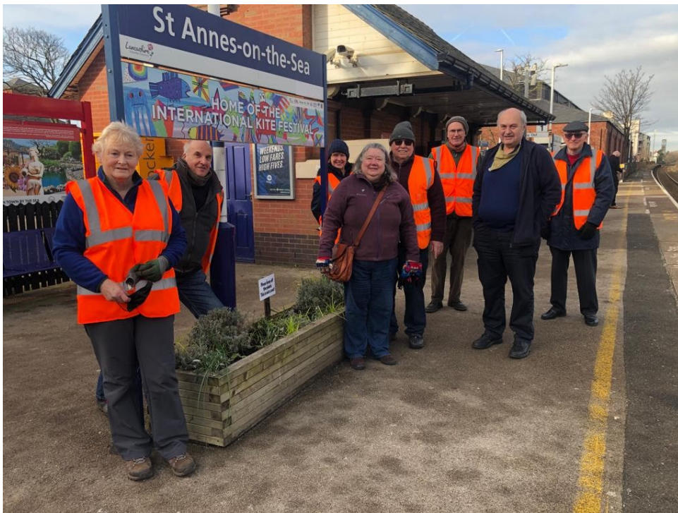
The Friends of Romiley Station at St. Anne's-on-the-Sea station

St Anne's station volunteers hosted station adopters from Romiley station and have shared their activities with other station groups through Northern's Station Adopters Facebook page.