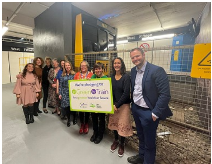
At Safety Works in Newcastle