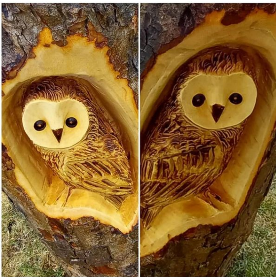
The hand carved owls

The colourful Hidden Gems artwork funded by St Anne's Town Council was unveiled by the Mayor and Deputy Mayor. At the same time, they unveiled eye-catching carved twin owls which had been created by a local woodcarver who made the most of a left-over tree stump