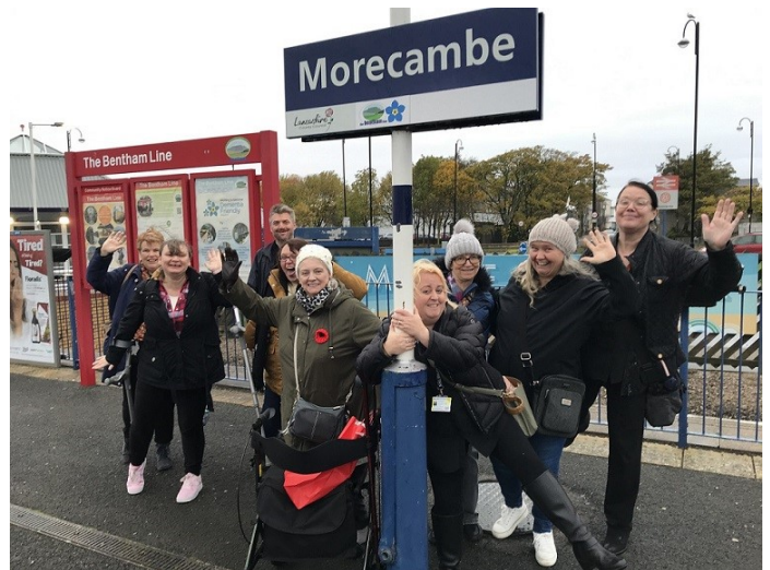
Enjoying Morecambe station