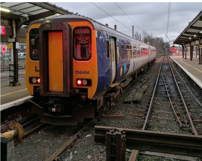
A Northern 156 unit sits in Preston's platform 4C

Avanti West Coast have recently approved a project to add to the ambiance and improve the facilities provided for passengers using Platforms 3c & 4c at the far south of the station. The trains from Colne (The East Lancashire Line) arrive at these platforms and trains to Ormskirk (The West Lancashire Line) depart from here and the facilities are currently very poor with little seating or signage. The project being led by Lancashire County Council in partnership with Community Rail Lancashire will include seating with planters made from recycled plastic, hanging baskets to compliment those already that already feature at the station and notice boards to provide more useful information for travellers.