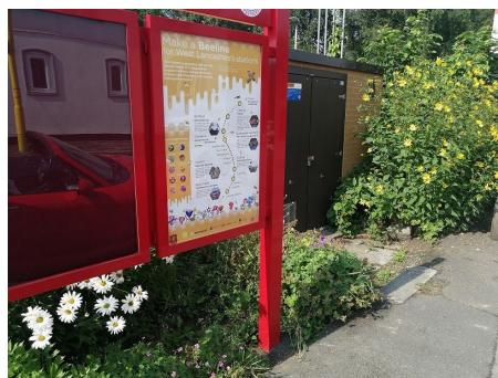
Bescar Lane Station