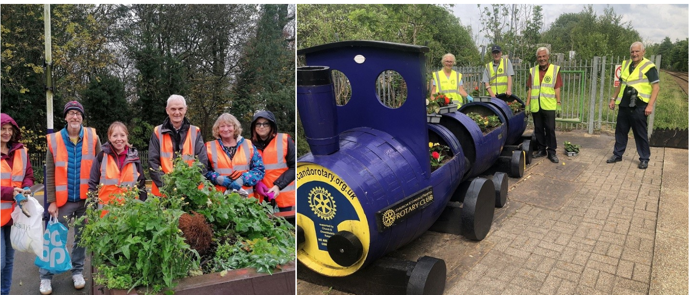
Station volunteers at Kirkham & Wesham (above left) and at Church & Oswaldtwistle (above right)

A big thank you must also be extended to the Lancashire Rail Ramblers who were able to provide a programme of guided walks from DalesRail as well as from stations on the East Lancashire and Clitheroe Lines.