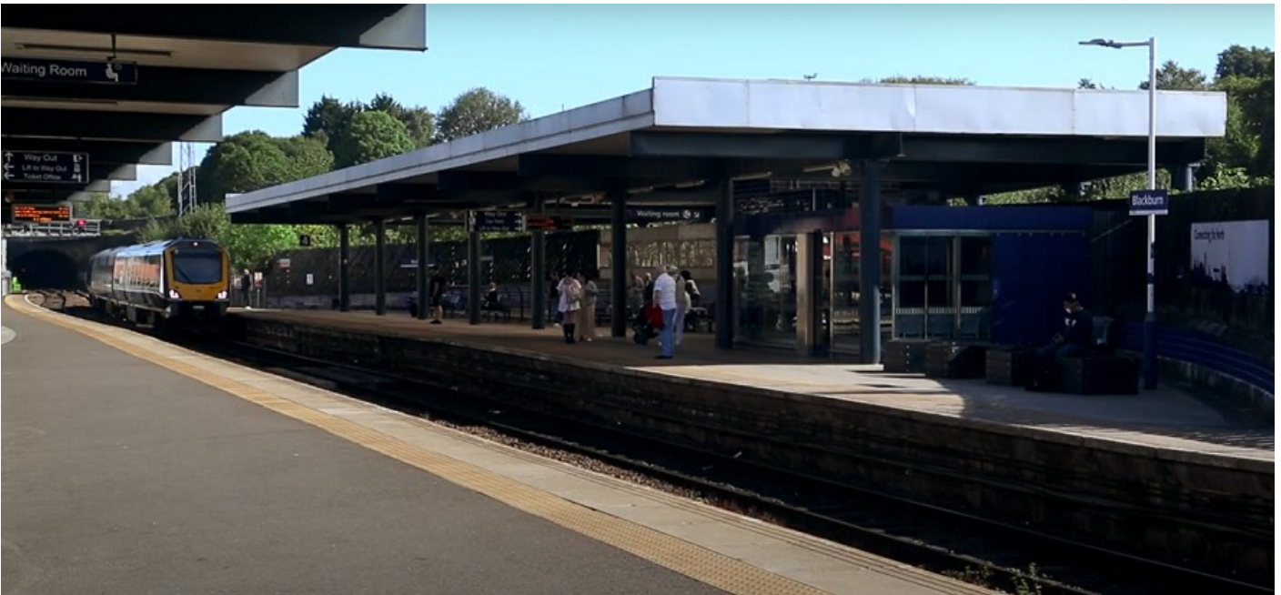
A view of platform 4 at Blackburn station

"I've just watched the Blackburn video, it's really good. I'm not on the spectrum but I would've found the video useful when I first started using the train by myself! The concept's a great idea... having an online video of a station makes perfect sense." Patrick Southern, Community Rail Network.