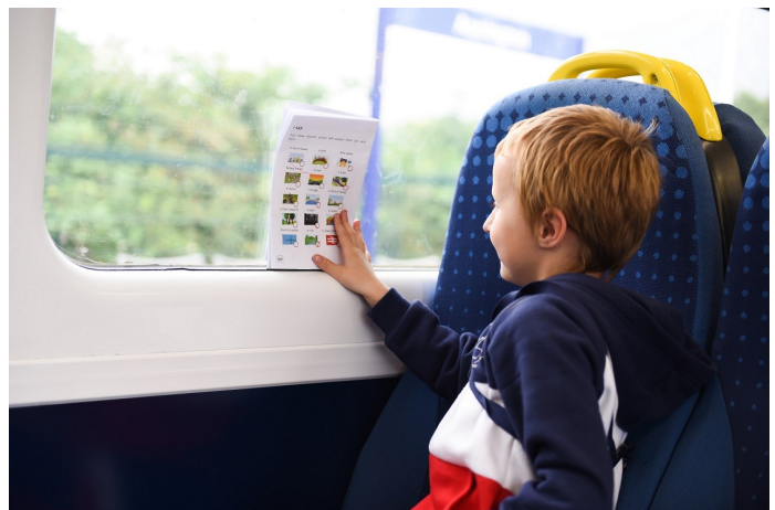
On the autism Friendly Line