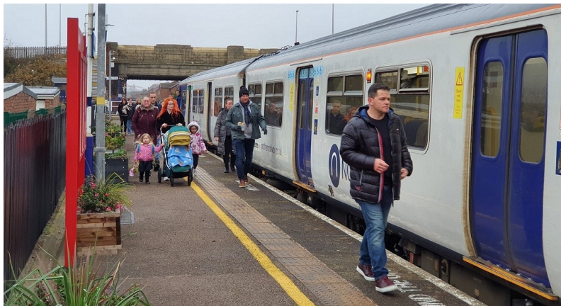
A busy Squires Gate Station

CRL also submitted comments as part of the Great British Railways Transition Teams (GBRTT) 'Whole Industry Strategic Plan' (WISP).