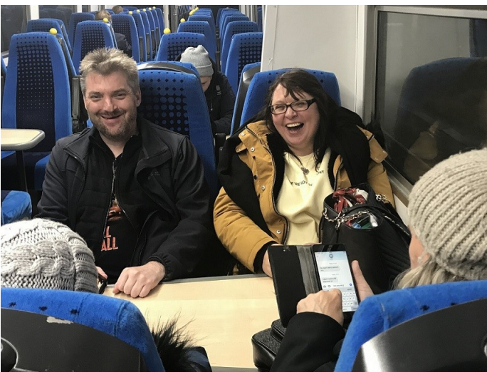
On the train to Morecambe

This project will, in a small way, help some of those who need a little extra support to do just that. The Deaf community is close-knit and by empowering a small number of BSL users who are respected in their communities, we can reasonably expect that a 'ripple effect' (through word-of-mouth and organic peer-supported journeys) will result in a larger number of people becoming (more) confident rail passengers.