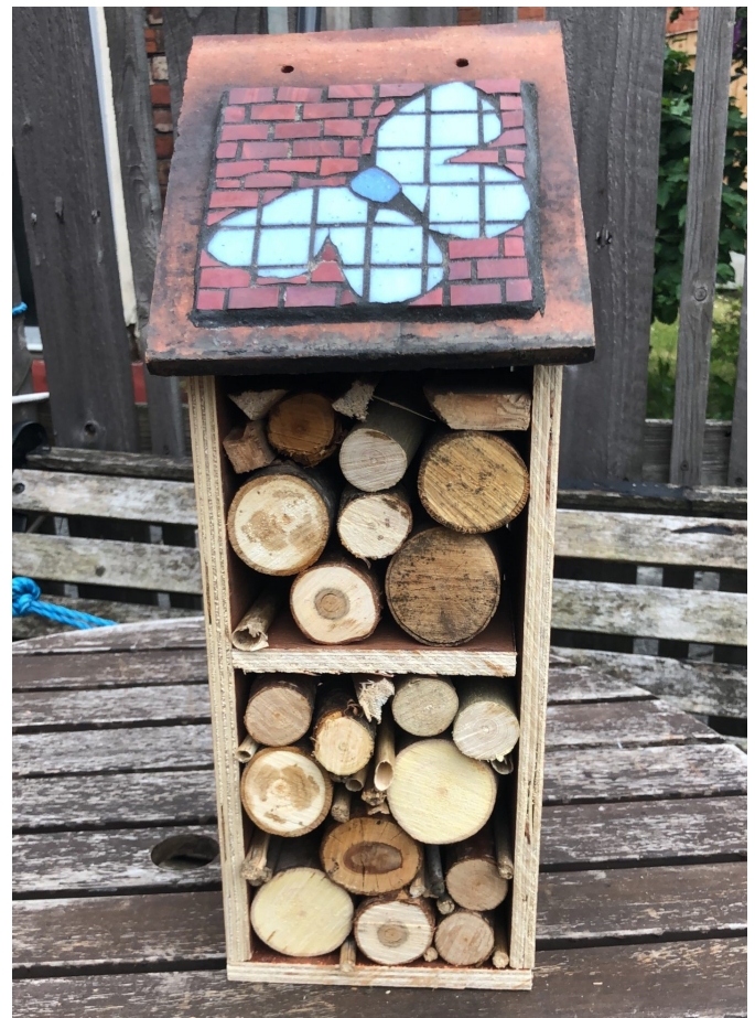
One of the new bug hotels on the disused platform