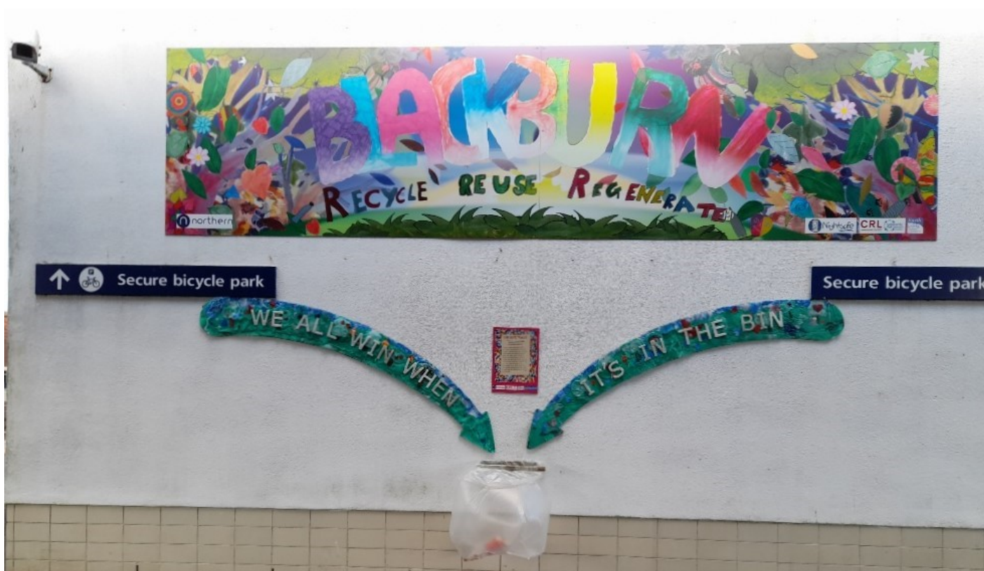
The Fantastic Plastic artwork in place encouraging people to recycle, reuse & regenerate

The idea for an art project that would promote sustainability and rail travel and somehow allow the school to part of the wider community was thought of. Fantastic Recycled Plastic came about after a discussion with school and artist. The idea was that a unique piece of artwork would be produced by the pupils using recyclable plastic. The plastic came from milk bottles that would be melted down and made into tiles that would then be formed into a piece of artwork that has been displayed on Blackburn Station and a replica will be displayed at the school. This complements a piece of work that was produced by the young people at NightSafe and is currently displayed at the Blackburn Station.