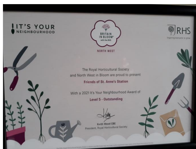
Level 5 (Outstanding) Awards were won by Lytham, Ansdell & Fairhaven and St Anne's and a Level 3 Award (Advancing) was won by Squires Gate.

https://communityrail Lancashire.co.uk/news/south-fylde-stations-clean-up-at-awards/