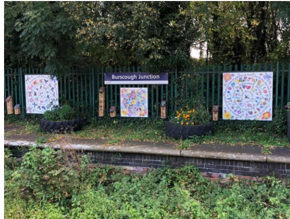
Art work and the bee & insect hotels on display