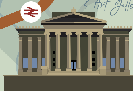
Harris Museum & Art Gallery