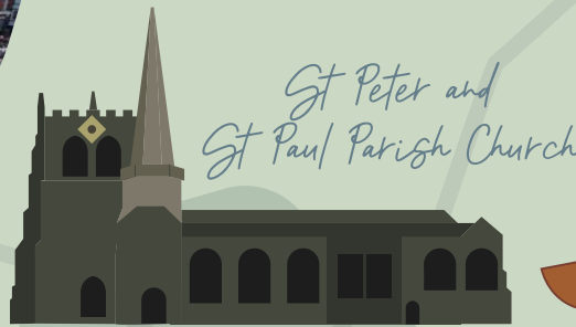
St Peter and St Paul Parish Church