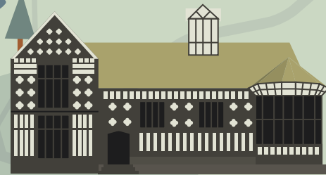
Rufford Old Hall

RUFFORD STATION is adjacent to the Rufford Branch of the Leeds and Liverpool canal. Easy towpath walks take you all the way to Top Locks, where it joins the Leeds Liverpool canal and onto Burscough.