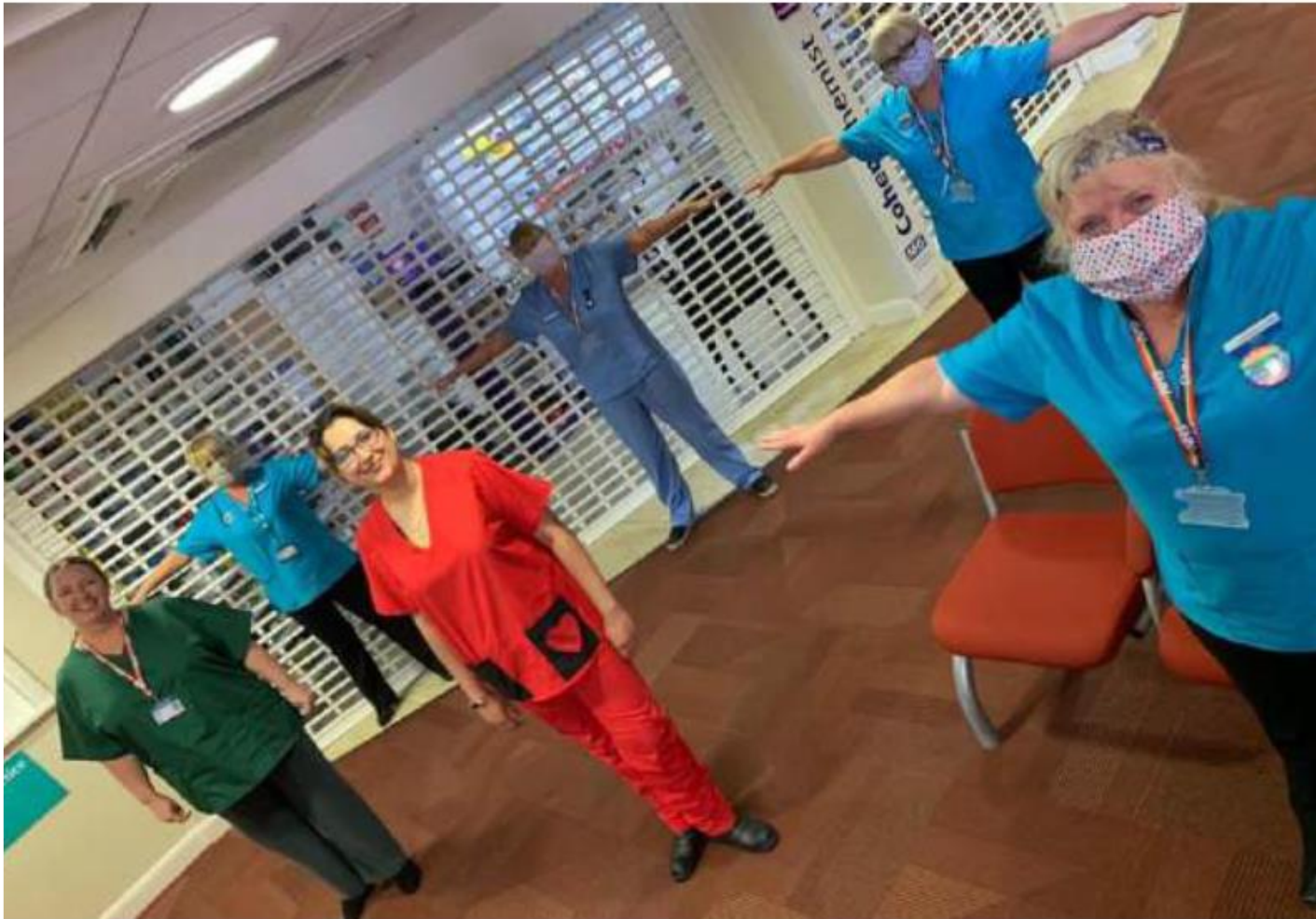
The award winning Scrubs project at Blackpool Victoria Hospital