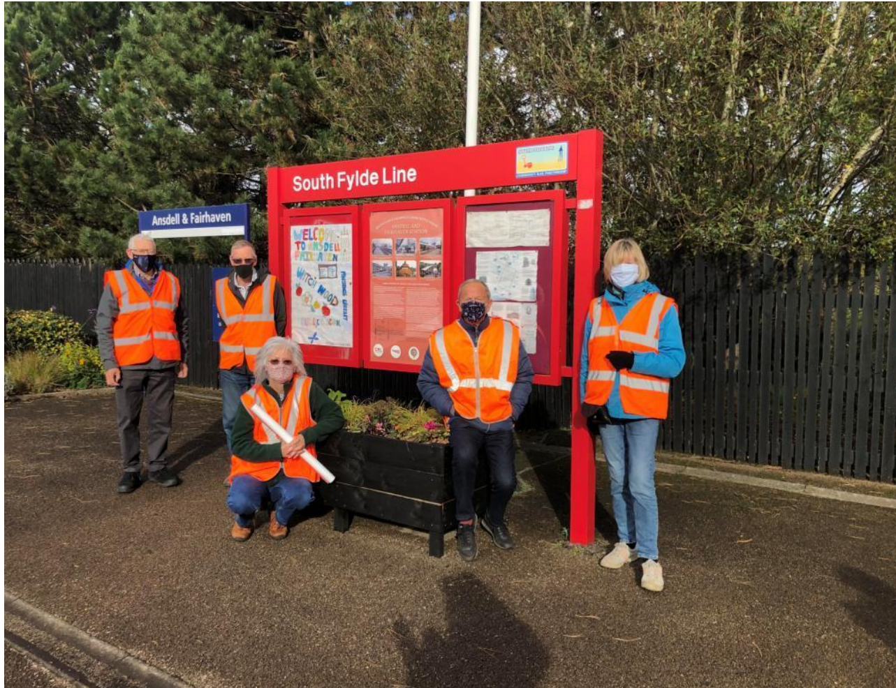
Ansdell & Fairhaven History Poster project – October 2020