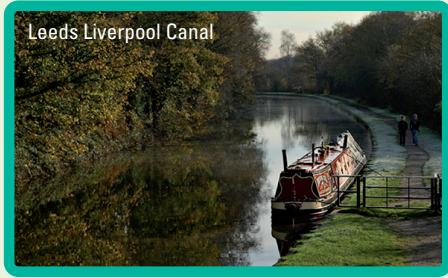
Leeds Liverpool Canal

to Wigan Full of heritage, surrounding countryside and shopping. The end of our Pier 2 Pier cycle route.