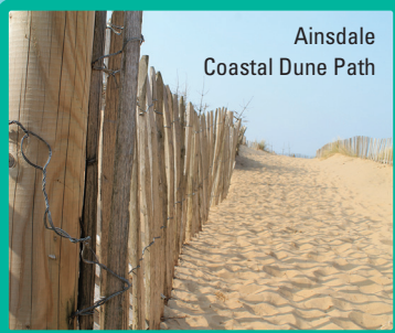
Ainsdale Coastal Dune Path

A classic seaside resort with stylish shopping along Lord Street, attractions for all the family and events throughout the year.