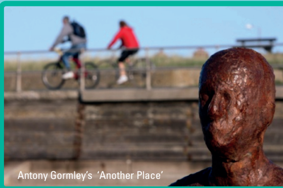
Antony Gormley's 'Another Place'

Blundellsands & Crosby Antony Gormley's 'Another Place' Crosby Leisure Centre Seafront