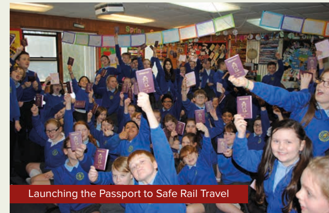
Launching the Passport to Safe Rail Travel