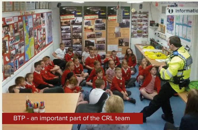
BTP - an important part of the CRL team