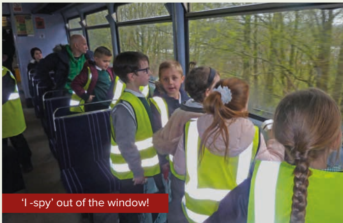
'I-spy' out of the window!

It is also important to remember that for many children (and teaching staff!) this may well be the first time they have travelled by train. So the experience needs to be memorable! Looking out of the window can be fun and also made into an activity that can be reinforced later at Accrington.