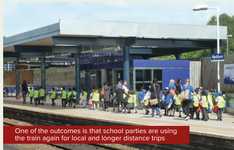
One of the outcomes is that school parties are using the train again for local and longer distance trips

Educating the 'PASSENGERS OF THE FUTURE'