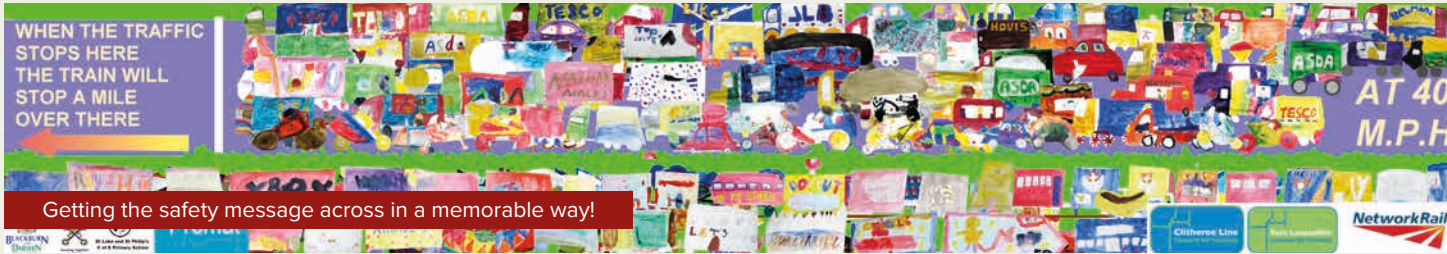
Getting the safety message across in a memorable way!

Mill Hill near Blackburn had fallen into decline and suffered from repeated vandalism and trespass resulting in a growing reluctance from the local residents to use the station. Blackburn with Darwen Council working in partnership with Northern Rail secured funding to install CCTV at the station. BwD then asked CRL to develop a community based project which became known as My Mill Hill. Amongst the many organisations that got involved were two primary schools who produced artwork highlighting the dangers of trespass on the railway. The artwork was made into a banner, see below, which was displayed on the fence facing the island platform.