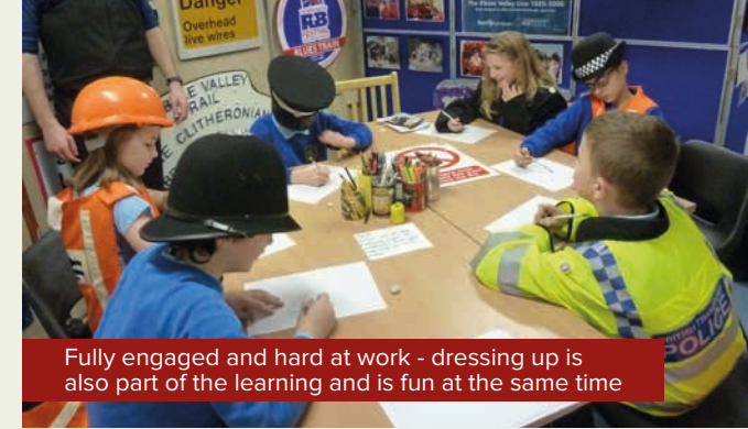
Fully engaged and hard at work - dressing up is also part of the learning and is fun at the same time