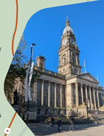
Bolton Town Hall